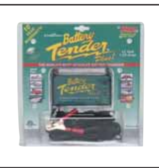
Battery Tender keeps your electric start generator's battery charged.

EU2000i Theft Deterrent Bracket Steel bracket with tamper-proof bolts deters thieves from cutting the plastic handle and removing a cable lock.