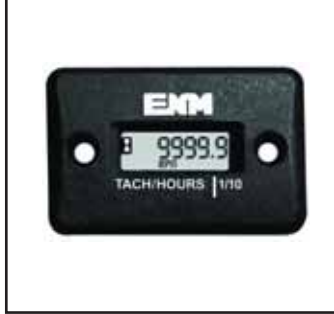
ENM Hour Meter monitors usage time for proper maintenance scheduling.