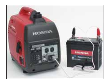
DC Charging Cord