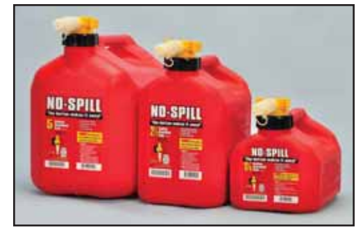
No Spill Gas Can