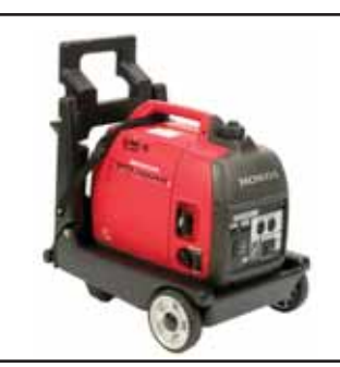
EU2000i Cart Adds wheels to your EU2000i. Includes a transportation strap to secure your generator.