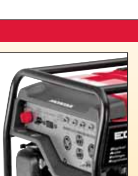
Frame Protection Economy models are all equipped with a steel frame for added protection and durability.

Rugged and reliable, the economy series generators are easy to take anywhere. Just load 'em up and go.