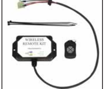
Wireless Remote Kit for convenient remote start/stop.