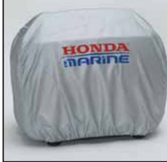
EU Storage Cover Marine Silver