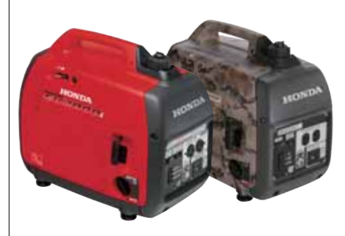
Honda's advanced inverter technology offers 1000 watts of super-quiet power to run a wide variety of small appliances, including computers and other sensitive electronic devices. Can run 4.0 to 8.3 hours on a single tank, depending on load. Perfect for lights, fans, TVs and small power tools.