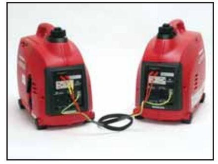
Parallel Cables for connecting two identical EU series generators.