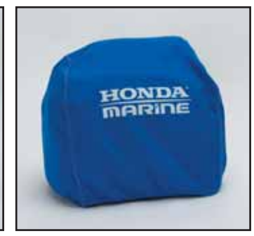
EU Storage Cover Marine Blue