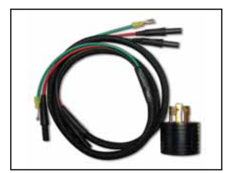
EU2000i Companion Parallel Kit for combining an EU2000i to an EU2000i Companion generator to double the power.