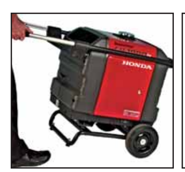
EU3000is Telescoping 2-Wheel Kit