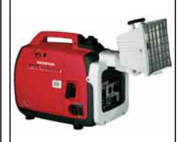
Tele-Lite Kit Lightweight folding halogen light is designed specifically for the EU1000i and EU2000i.