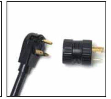
RV Adapter Plug