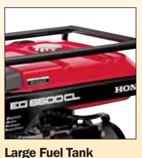
Experience a longer run time with a new, larger fuel tank (3x larger than previous EG models).

120/240 Volt Selector Switch This enables full generator wattage for short durations through the 120 volt outlets to power high initial start-up wattage requirements.