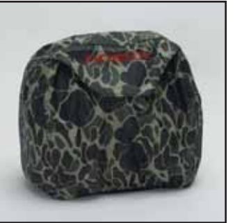
EU Storage Cover Camo