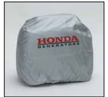
EU Storage Cover Silver