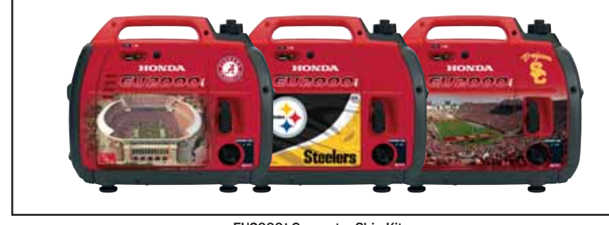
EU2000i Generator Skin Kits Collegiate, NFL and NASCAR skins available. See your Honda dealer for details.