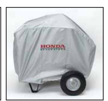
Universal Folding Handle Cover